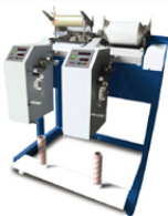
TN-25 高速度紗機種類規格 配製圖、單位mm/Layout, Unit mm