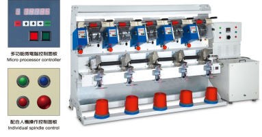
外觀尺寸 | Dimension unit: mm

Max. 10000 r.p.m. Max. 1600mm (800-1400mm/min) TN-35F(P)-Y Max. 4000 r.p.m. Max. 1000mm (400-800mm/min)