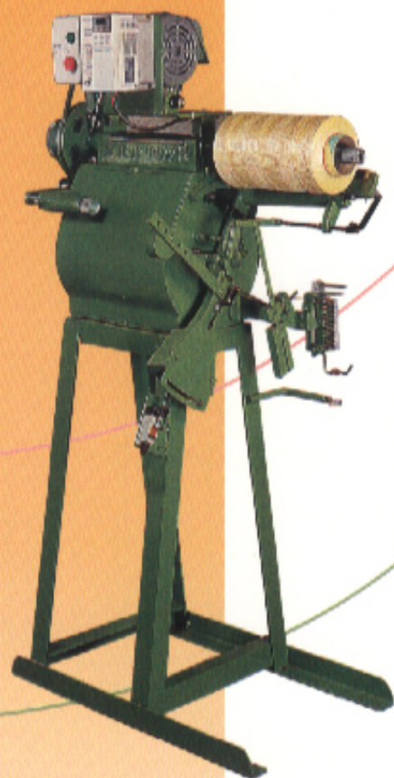
TN-01V 立式繞線(繩)機 Vertical Type Cross Cone Winder